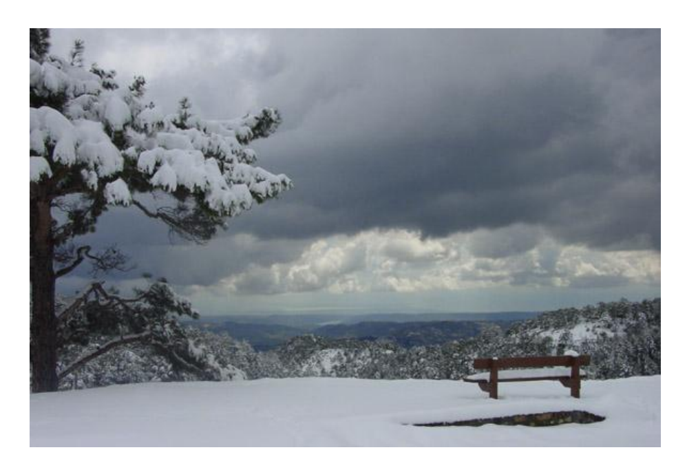
Troodos Mountains in winter

Cyprus has the warmest climate (and warmest winters) in the Mediterranean part of the European Union. The average annual temperature on the coast is around 24 °C (75 °F) during the day and 14 °C (57 °F) at night. Generally – summer's/holiday season lasts about 8 months, begins in April with average temperatures of 21–23 °C (70–73 °F) during the day and 11–13 °C (52–55 °F) at night, ends in November with average temperatures of 22–23 °C (72–73 °F) during the day and 12–14 °C (54–57 °F) at night, although also in remaining 4 months temperatures sometimes exceeds 20 °C (68 °F). Middle of summer is hot - in the July and August on the coast the average temperature is usually around 33 °C (91 °F) during the day and around 23 °C (73 °F) at night (inside the island, in the highlands average temperature exceeds 35 °C (95 °F)) while in the June and September on the coast the average temperature is usually around 30 °C (86 °F) during the day and around 20 °C (68 °F) at night.