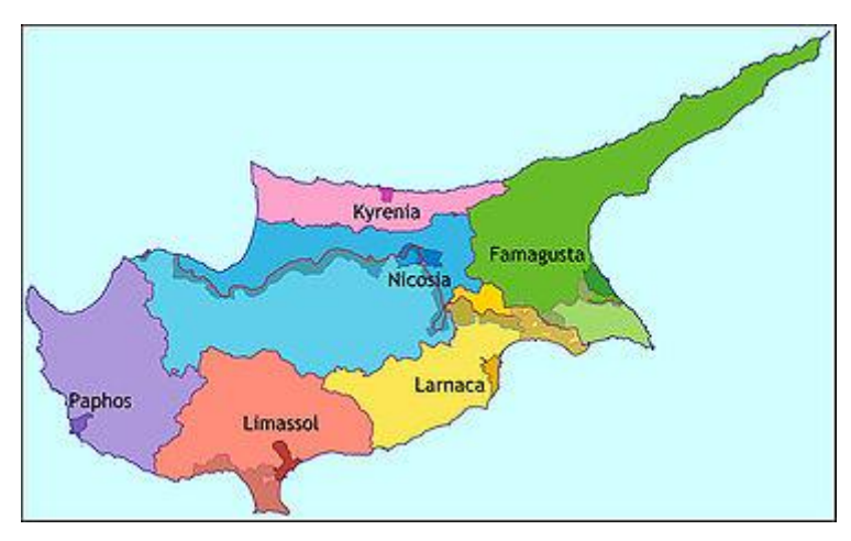
Map of Cyprus Districts

Nicosia, is the capital and largest city of both Cyprus and the Turkish Republic of Northern Cyprus. Located on the River Pedieos and situated almost in the centre of the island, it is the seat of government as well as the main business centre. Nicosia is the capital of the Nicosia District.