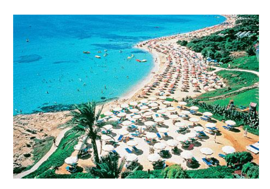
Ayia Napa beaches

Ayia Napa attracts a large number of tourists and features a number of bathing beaches, on which water sports such as water-skiing, windsurfing, canoeing, scuba diving, and speed boating are popular. The Cyprus Tourism Organization supervises the beaches and is responsible for protecting the interests of all tourists.