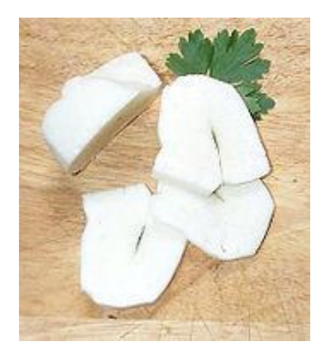
Slices of fresh halloumi cheese with mint leaves packed in the center

Fresh vegetables and fruits are common ingredients in Cypriot cuisine. Frequently used vegetables include courgettes, green peppers, okra, green beans, artichokes, carrots, tomatoes, cucumbers, lettuce and grape leaves, and pulses such as beans, broad beans, peas, black-eyed beans, chick-peas and lentils. The commonest among fruits and nuts are pears, apples, grapes, oranges, mandarines, nectarines, mespila, blackberries, cherry, strawberries, figs, watermelon, melon, avocado, lemon, pistachio, almond, chestnut, walnut, hazelnut.