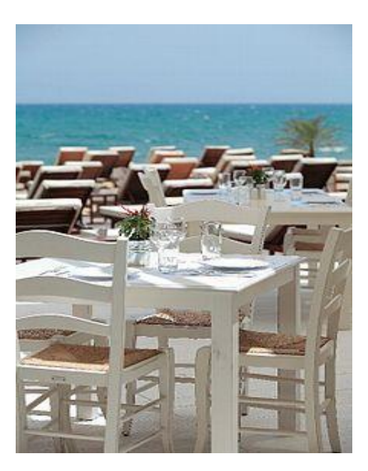
Typical seaside tavern in Larnaca

Fresh vegetables and fruits are common ingredients in Cypriot cuisine. Frequently used vegetables include courgettes, green peppers, okra, green beans, artichokes, carrots, tomatoes, cucumbers, lettuce and grape leaves, and pulses such as beans, broad beans, peas, black-eyed beans, chick-peas and lentils. The commonest among fruits and nuts are pears, apples, grapes, oranges, mandarines, nectarines, mespila, blackberries, cherry, strawberries, figs, watermelon, melon, avocado, lemon, pistachio, almond, chestnut, walnut, hazelnut.