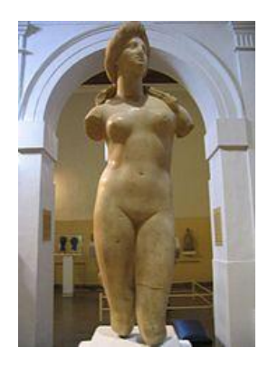
Aphrodite, Greek goddess of love, beauty, and sexuality is said to be born in Cyprus

Aphrodite, Greek goddess of love, beauty, and sexuality is said to be born in Cyprus. The art history of Cyprus can be said to stretch back up to 10,000 years, following the discovery of a series of Chalcolithic period carved figures in the villages of Khoirokoitia and Lempa and the island is also the home to numerous examples of high quality religious icon painting from the Middle Ages.