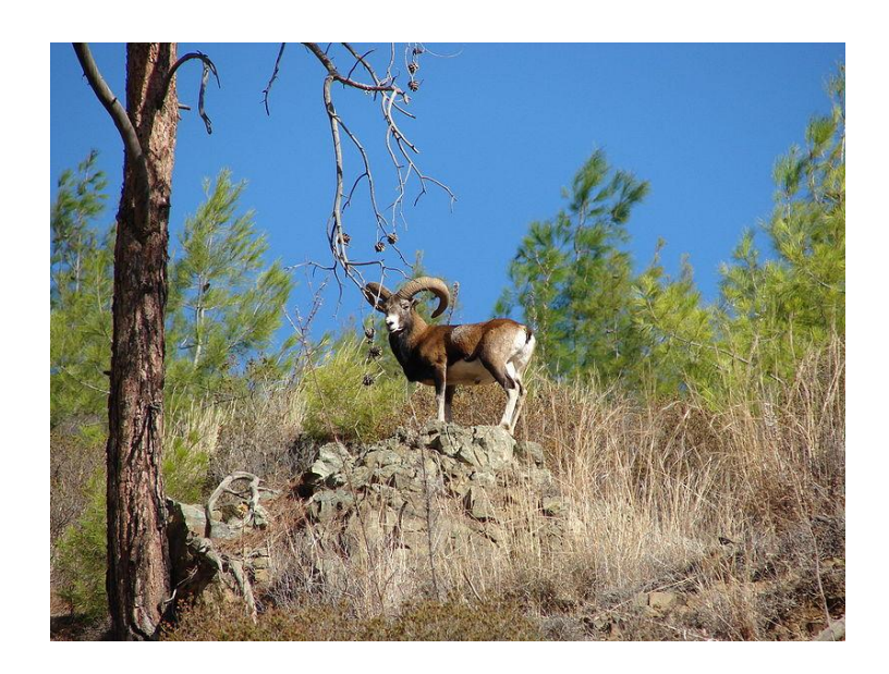
Cyprus wild Mouflon

One of the unique features of Cyprus' habitats is the wild and sharp differences in elevations and habitats in different parts of the island as well as different climate conditions, all of which supply a diverse habitat for a unique array of fauna and flora. The number of plant species and sub-species of wild plant in Cyprus is possibly in the thousands, many of them being endemic. Wildlife can be seen in Troodos mountains, Larnaca salt lake, Akrotiri salt lake and undoubtedly Akamas national park. Cyprus is home to Cyprus moufflon which is a national symbol of the country. Moufflon is protected and can be seen in Paphos forests towards branches of Troodos Mountain.