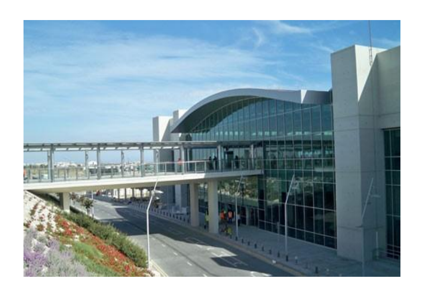
Larnaca International Airport

Public transport in Cyprus is limited to privately run bus services (except in Nicosia), taxis, and interurban 'shared' taxi services (referred to locally as service taxis ). In 2006 extensive plans were announced to improve and expand bus services and restructure public transport throughout Cyprus, with the financial backing of the European Union Development Bank. The main harbours of the island are Limassol harbour and Larnaca harbour, which service cargo, passenger, and cruise ships.