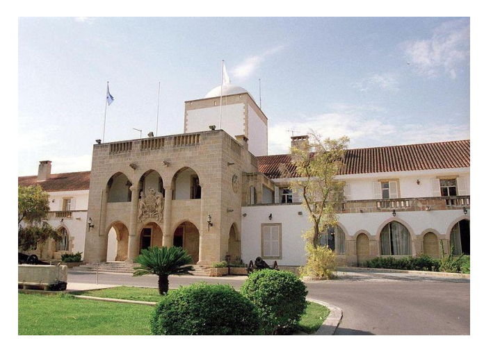
The Presidential Palace (Residence) in Nicosia

Cyprus is a Presidential republic. The head of state and of the government is elected by a process of Universal suffrage for a five-year term. Executive power is exercised by the government with legislative power vested in the House of Representatives whilst the Judiciary is independent of both the executive and the legislature.