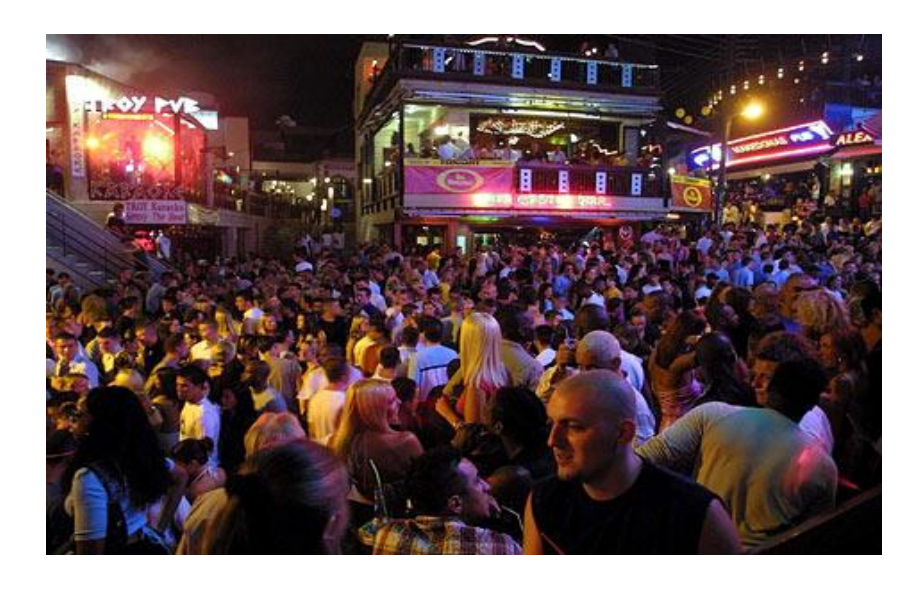
Night in Ayia Napa