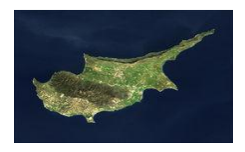
Topographic image of Cyprus